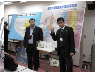
Training in Japan