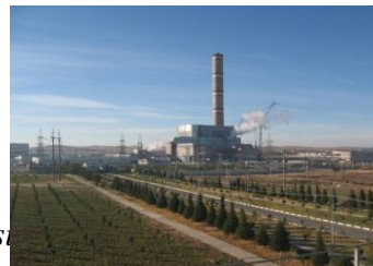
Talimarjan Power Plant (Loan)