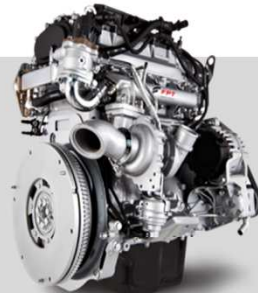
Engines and Transmissions