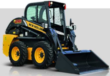
Skid Steer Loaders