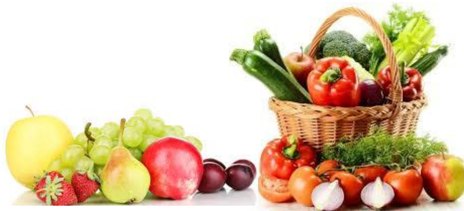
new promising varieties

These measures contribute to development of production and losses reduction at the first stage of the whole production cycle