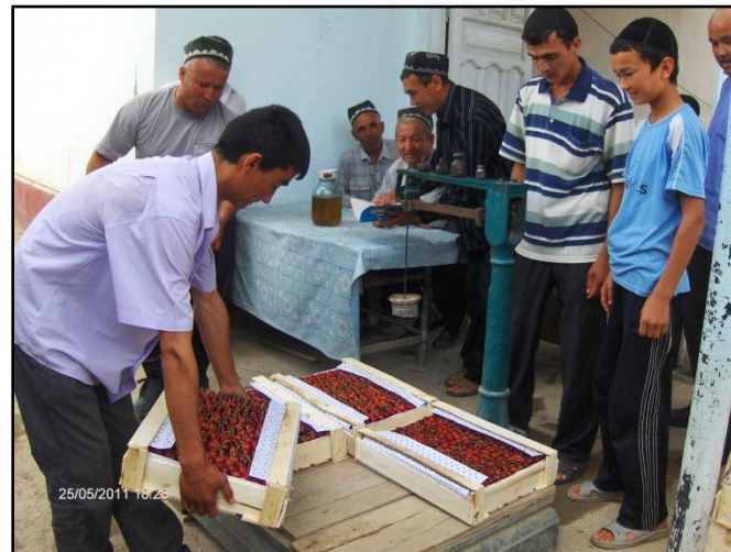
Assembling Cherries for Export