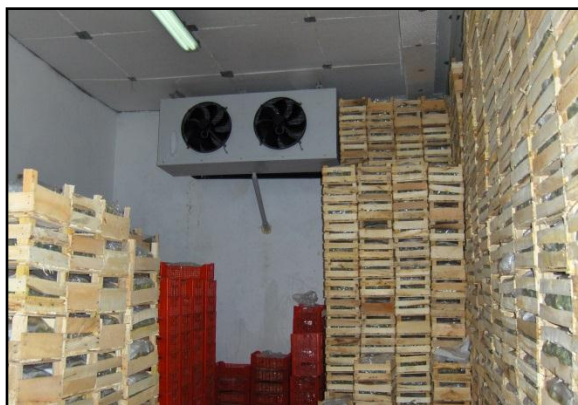
Cold Storage of Grapes