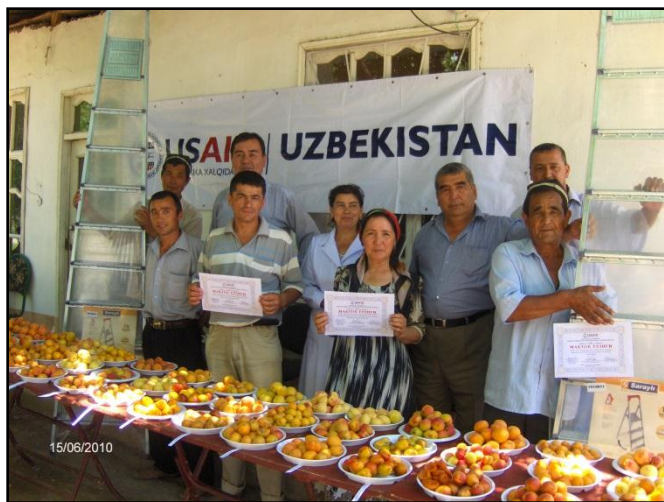
Apricot Variety Contest